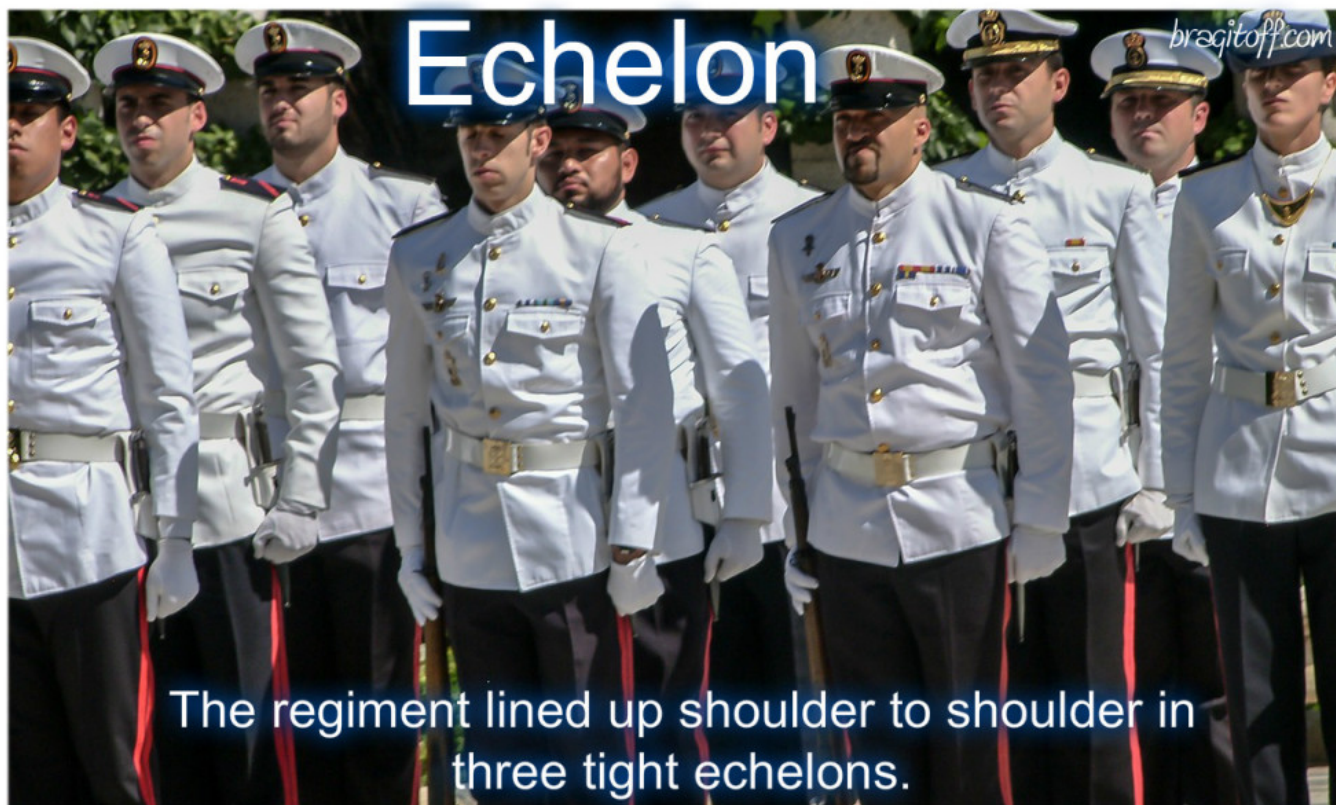
image sentence: The regiment lined up shoulder to shoulder in three tight echelons.

The Visual Dictionary makes use of striking visuals accompanied with related sentences.