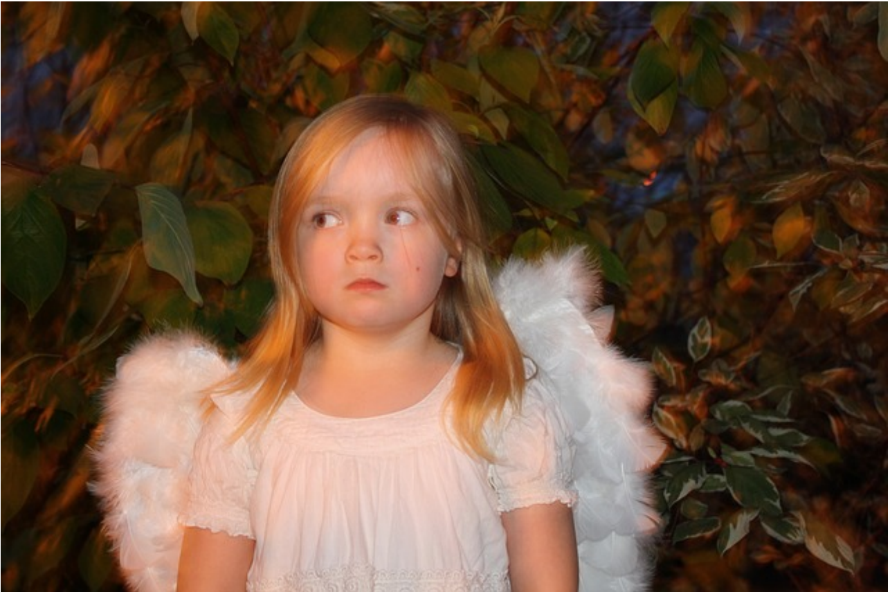
image sentence: The kid gave her mother a sardonic look when she dressed her up as an Angel.