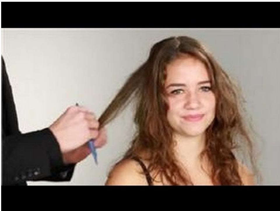
image sentence: The hair dresser was having a hard time untangling the snarly hair of the girl.

Modification: by adding a y in the end it can be used as an (adjective): snarly