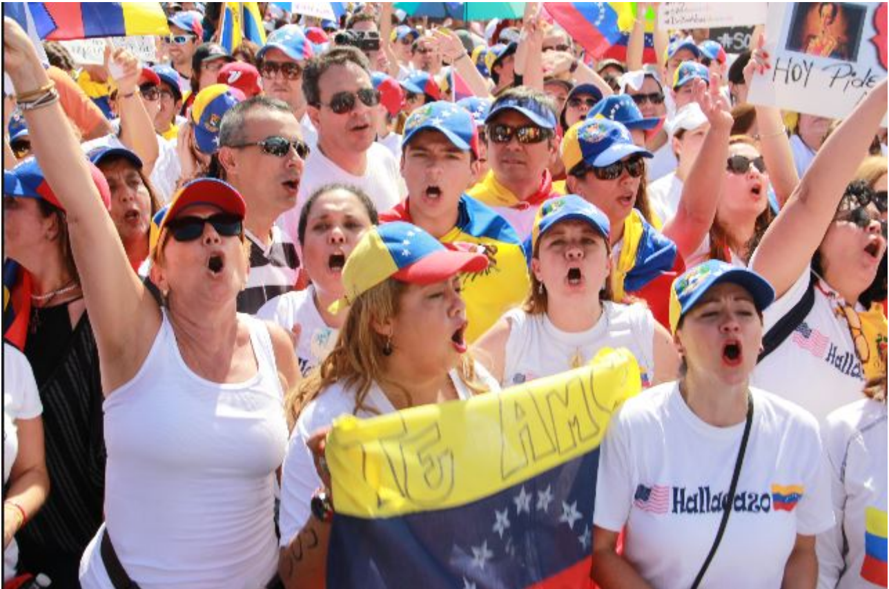
image sentence: The crowd clamored on the streets for freedom in Venezuela.