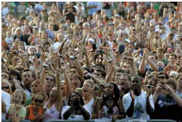
image sentence: The crowd clamored when Justin Bieber sang his hit song, 'Baby'.

image sentence: The crowd clamored on the streets for freedom in Venezuela.